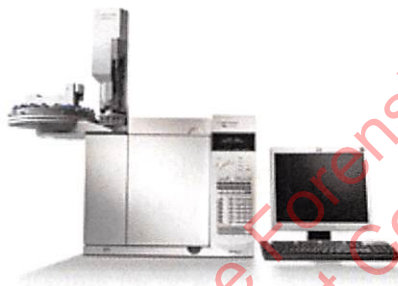
Figure 2. Gas Chromatograph