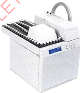
Figure 3. Headspace Analyzer